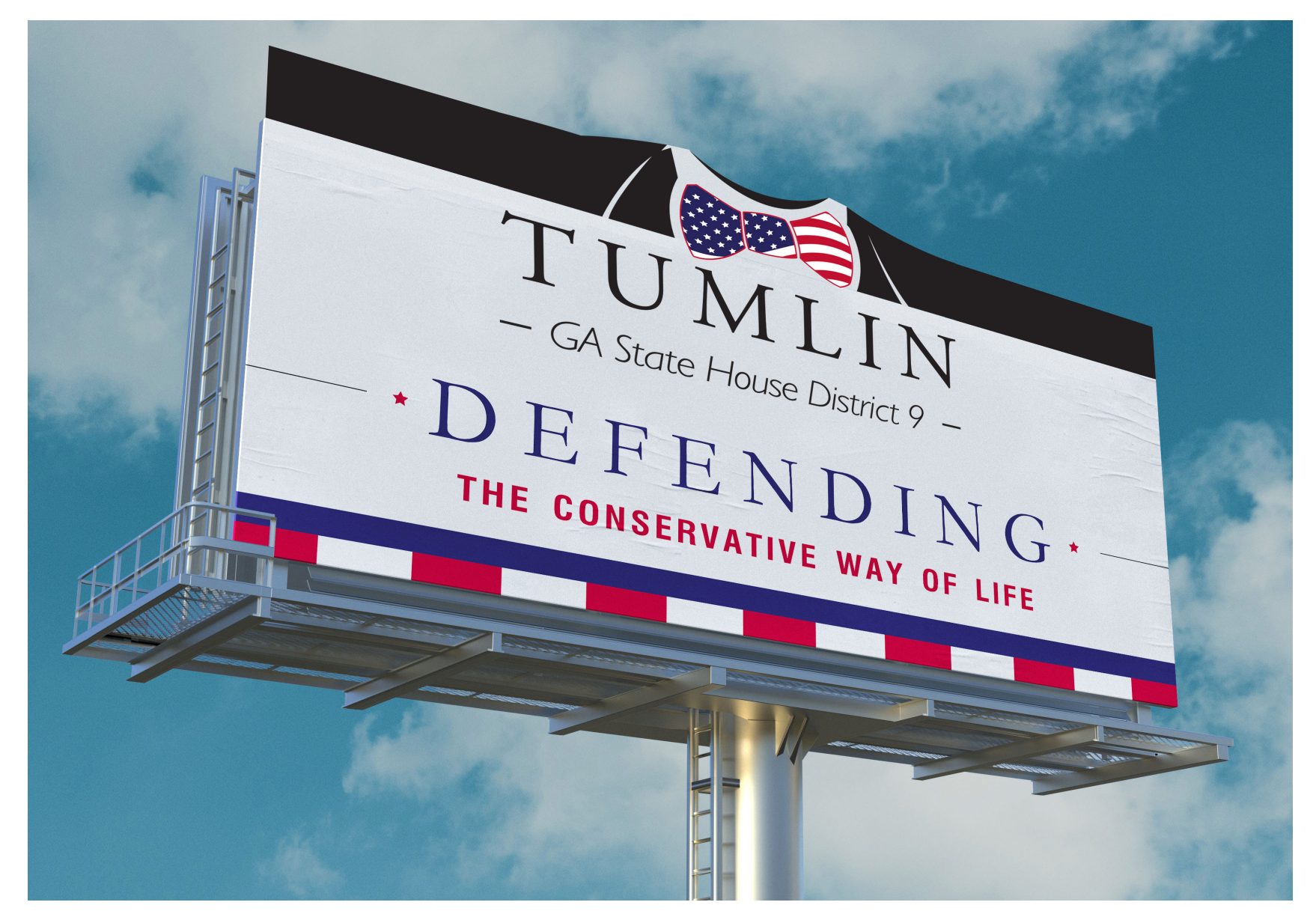
This concept utilizes an add-on to the billboard which would be an additional cost. However, the application does make it standout in the crowd of billboard design. All designs (if budget and ordinances allow) could use added features like custom lighting, 3D standoffs for the logo, back-lighting, etc. Layout can be applied to a standard size as well if the design is one you want to pursue.